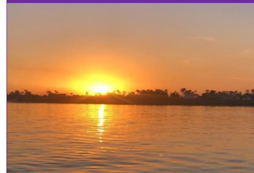
Sunset view on the Nile River

Now Booking! Payment plan is available. $1200 deposit to secure space. $1650 balance due 72 hours prior to retreat. Deposit refundable within 14 days of payment. There are no refunds or cancellations after 2 weeks of reserving your space. Visa/Mastercard, AMEX, or Venmo payments are accepted.