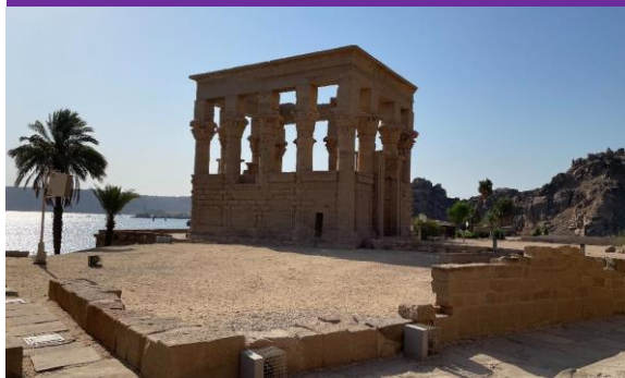
Temple of Philae in Aswan