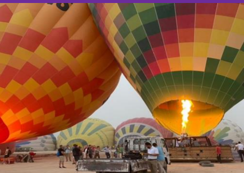
Balloon Ride, Luxor