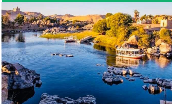
Nile River in Aswan

Experience the healing vortex in the Mother Land