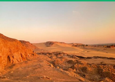
Desert View, Luxor