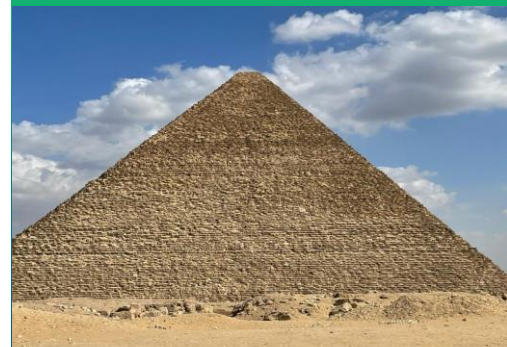
The Great Pyramids of Giza

Experience the healing vortex in the Mother Land